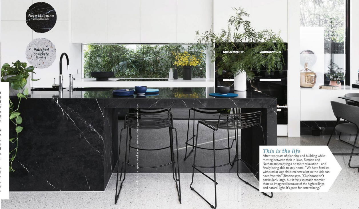
Photo subject is reproduced as accurately as printing processes allow.

KITCHEN White semi-gloss cabinetry rises to the ceiling while black in the appliances, furniture and island bench's stunning Nero Maquina marble rules at ground level. Peeking through the clear-glass splashback is Bambusa textilis 'Gracilis' supplemented by lots of green in the plants and foliage throughout. Appliances, Miele. Smart buy: 'Velletri' wire stools, $349 each, Huset. ENTRANCE Harper with Bentley, the family's six-year-old cavoodle. The curved staircase is one of Martin Friedrich's signature designs. Polished concrete floor, Mentone Premix.