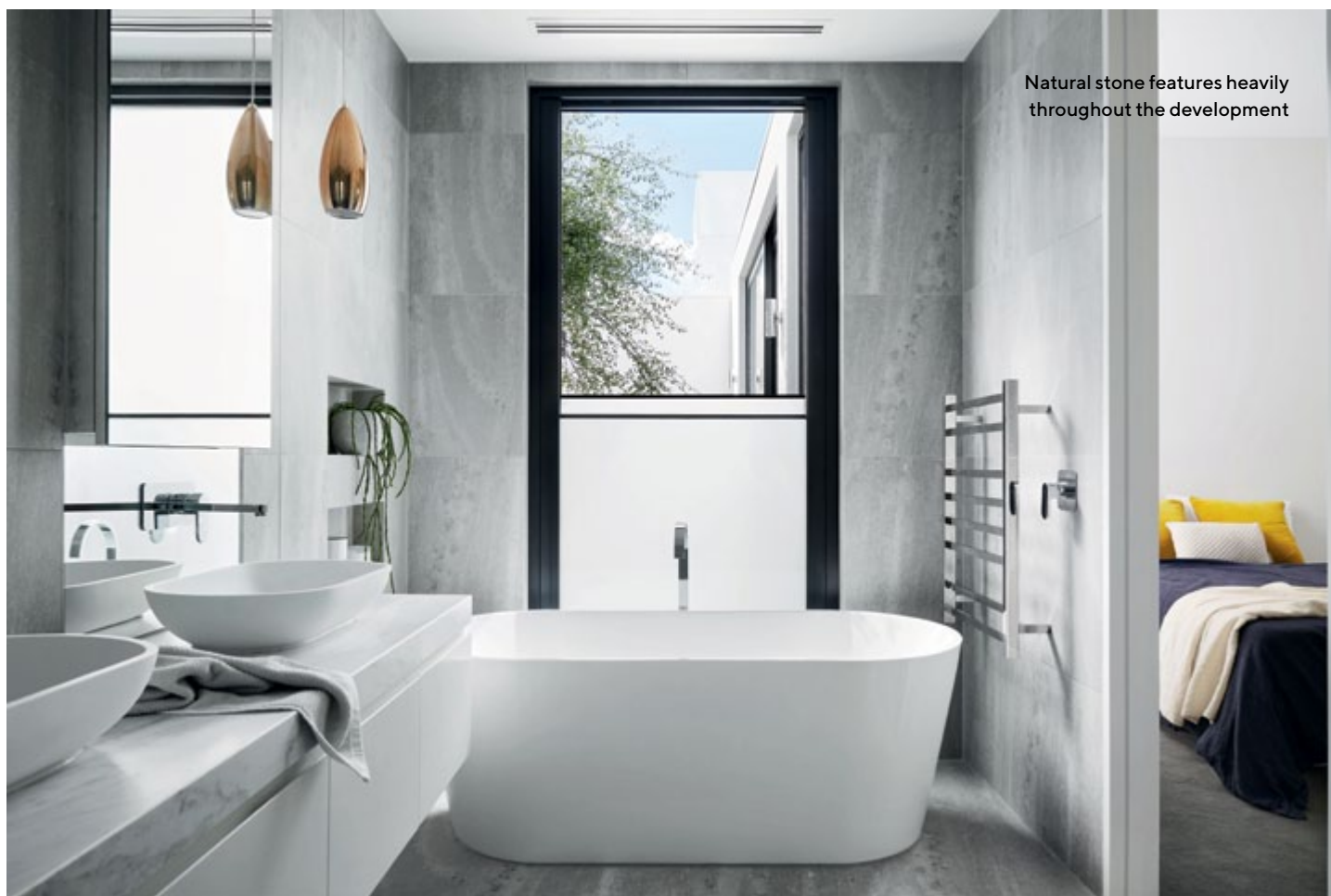
Natural stone features heavily throughout the development

passage of water in the event of a flood,” Jaydn notes.