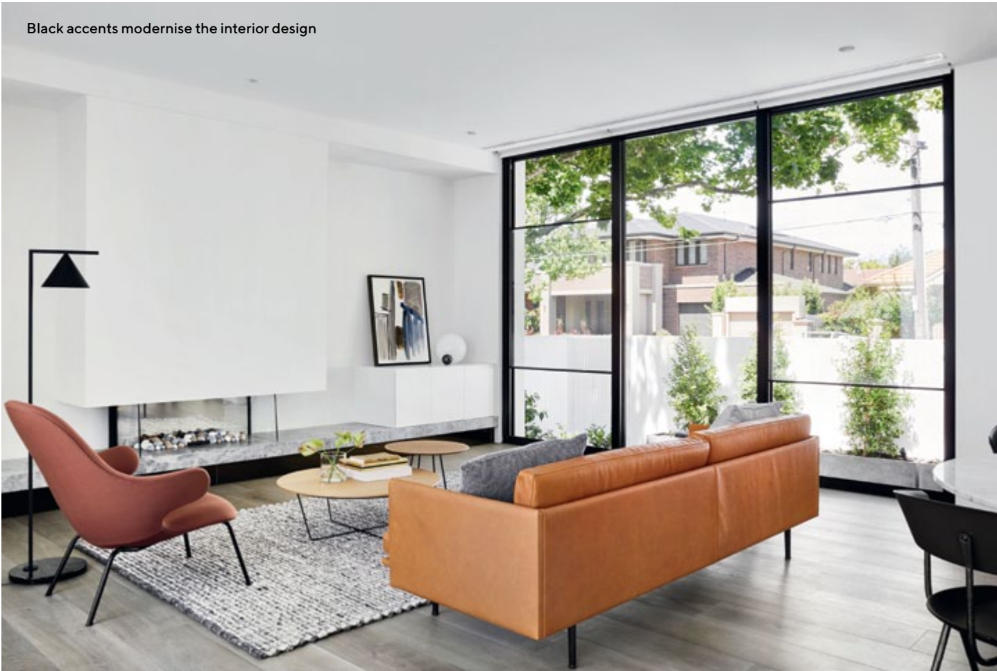
Black accents modernise the interior design